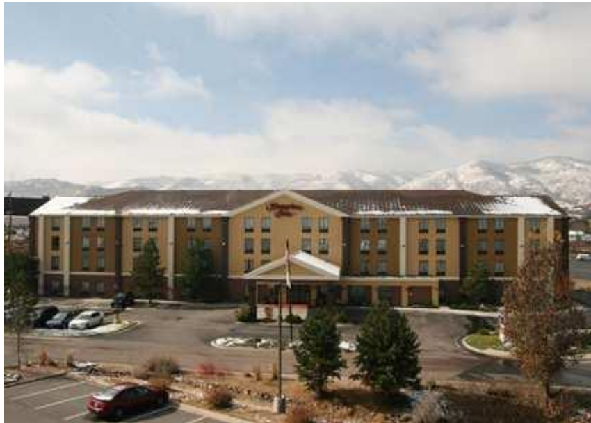
The Hampton Inn Denver-West/Golden

The Hampton Inn is 35.2 miles from Denver International Airport, 12.5 miles from downtown Denver, and 3.5 miles from the American Mountaineering Center. It is just off I-70, with complimentary guest parking on-site.