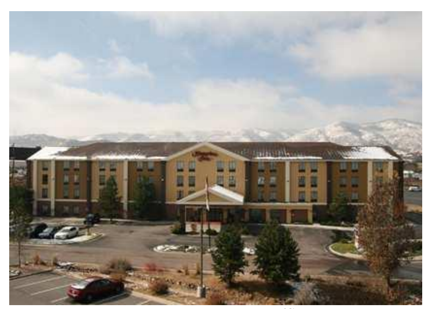
The Hampton Inn Denver-West/Golden

Standard Double/Double Room: $109 per room, per night, plus local sales tax The Hampton Inn is 35.2 miles from Denver International Airport, 12.5 miles from downtown Denver, and 3.5 miles from the American Mountaineering Center. It is just off I-70, with complimentary guest parking on-site.